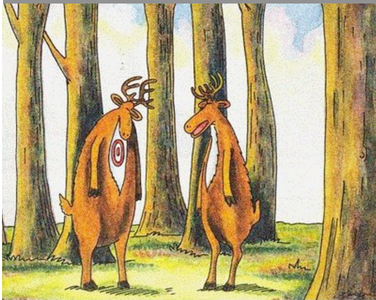
"Bummer of a birthmark, Hal!"